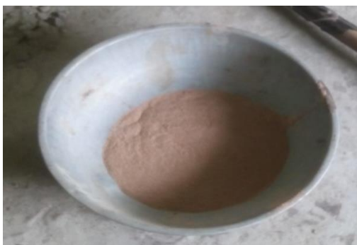
Fig 1. Ceramic tile powder

CERAMIC TILE POWDER : The ceramic powder is obtained from the industrial by – products or as the solid waste dumped in any major city. As the ceramic in landfill it takes thousands of years to degradable and cause land pollution. So some of not recycled ceramic can be converted into ceramic powder and used as cement replacement. The usage of ceramic in the form of powder is better than using it as fine or coarse aggregate. The tile dust is obtained from RAK ceramics. The specific gravity of tile dust is found to be 2.62 and the fineness is found to be 7.5%.